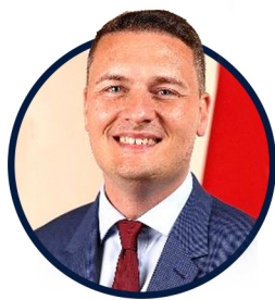
RT HON'BLE WES PAUL WILLIAM STREETING MP

Parliamentary Secretary of State for Health and Social Care, United Kingdom