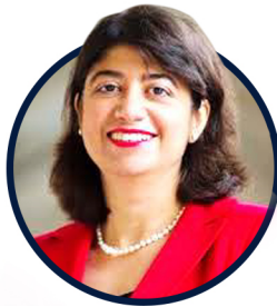
MRS. SEEMA MALHOTRA MP

Parliamentary Under Secretary of State (Minister for Migration and Citizenship) and Parliamentary Under Secretary (Minister for Equalities) United Kingdom