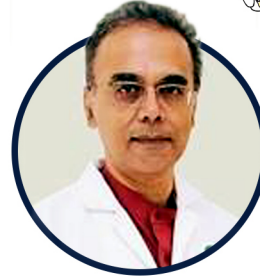
DR ASHOK PHILIP

Parliamentary Under Secretary of State (Minister for Migration and Citizenship) and Parliamentary Under Secretary (Minister for Equalities) United Kingdom